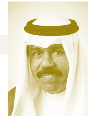
H.H. Shaikh Nawaf Al-Ahmed-Al-Jaber Al Sabah Crown Prince