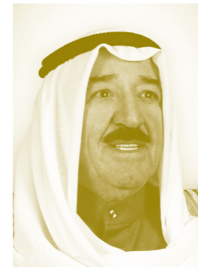
H.H. Shaikh Sabah Al-Ahmed-Al-Jaber Al Sabah Amir of State of Kuwait